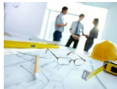
Find architectural resources

All components, including hand control, are sealed, waterproof, and UL listed.